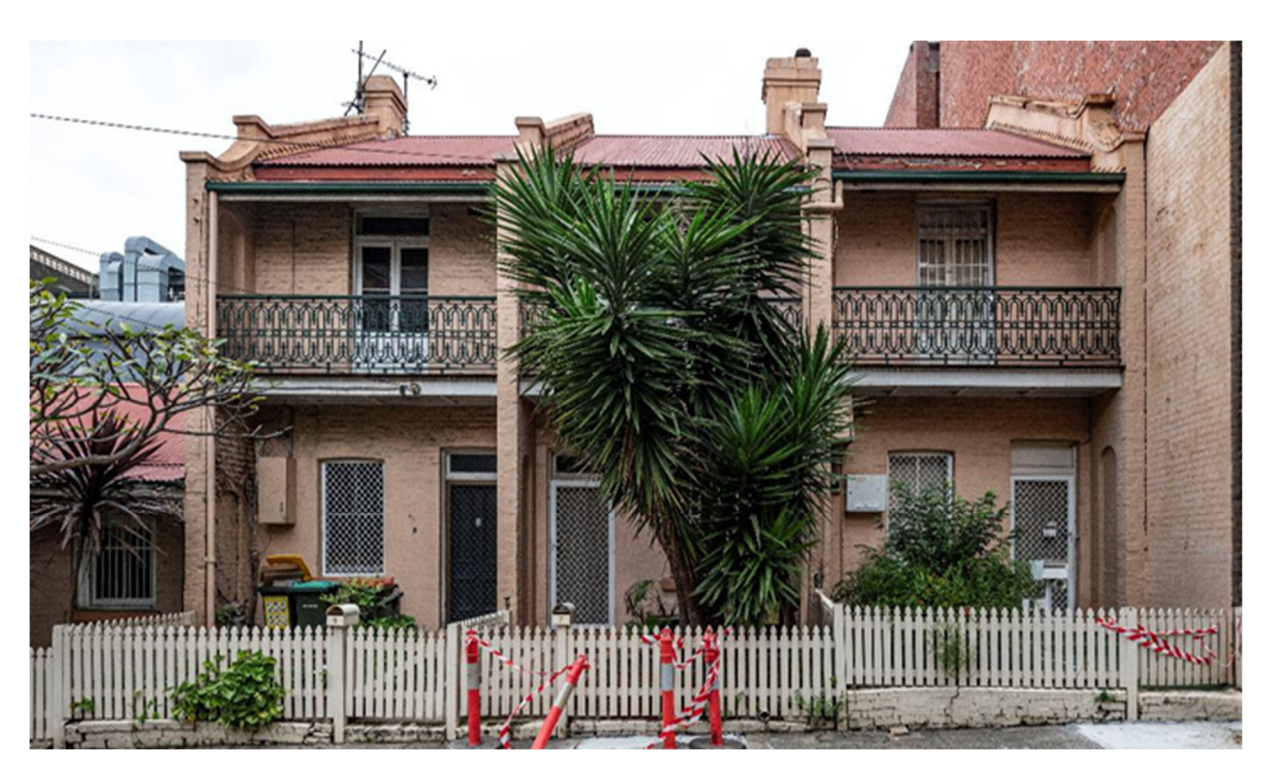
Terraces 9 – 5 Norman St