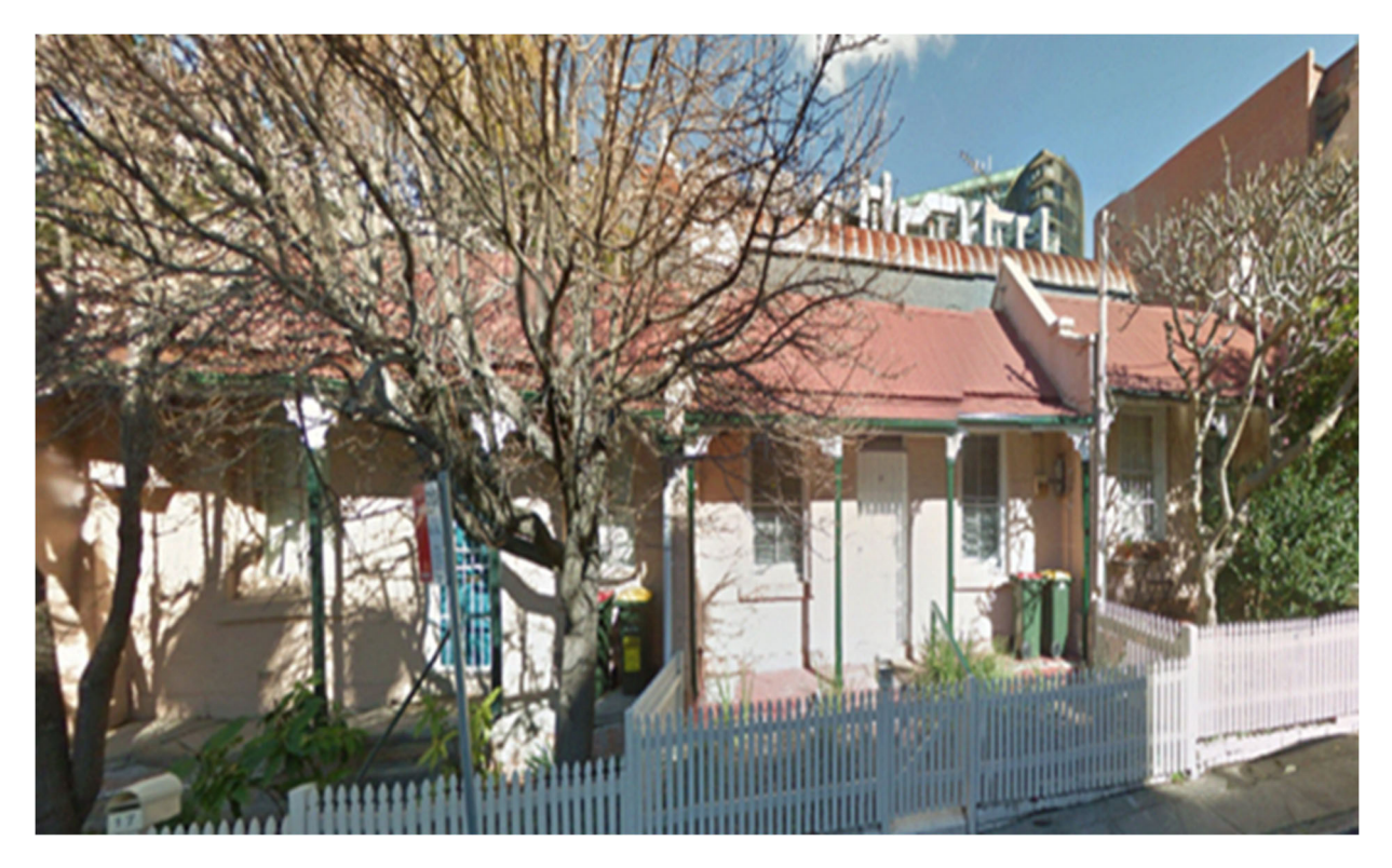
Terraces 17-11 Norman St